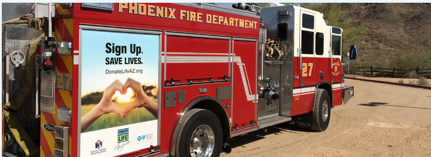
One of the 10 fire trucks wrapped with Donate Life Arizona's message of donation located in the Phoenix area.

W hat do fire trucks and organ and tissue donation have in common? On the surface, perhaps not much. But the reality is that firefighters do more than fight fires.